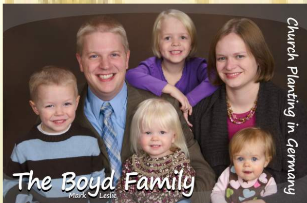
Church Planting in Germany